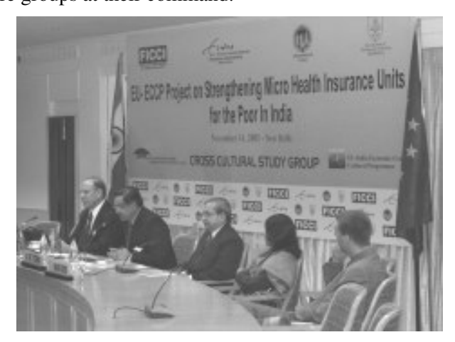
Federation of Indian Chambers of Commerce and Industry

(a) Professional Pressure Groups: - This category includes the pressure groups that are formed by the employees of a particular occupation or profession for the protection of their interests. The big business houses with their vast outlay of resources, availability of technical and managerial personnel and due to close links elite groups in government, media, administration and opposition parties have always had the most organized and powerful pressure groups at their command.