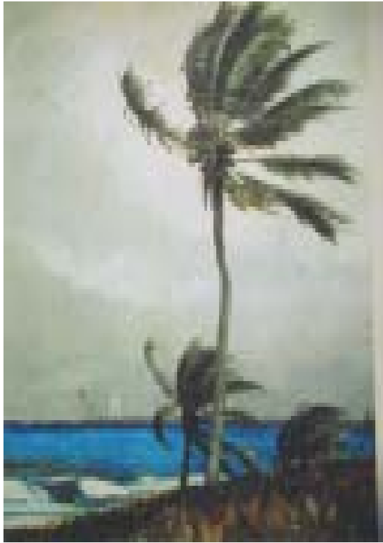
Light House (Water colour) by Homer