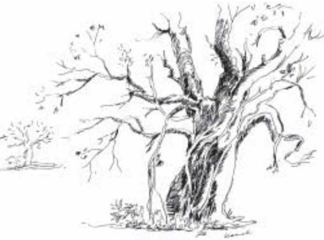
Fig No. 18