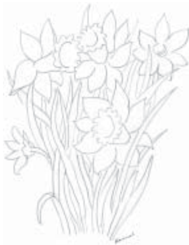
Fig No. 12