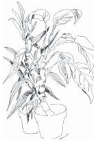
Fig No. 16