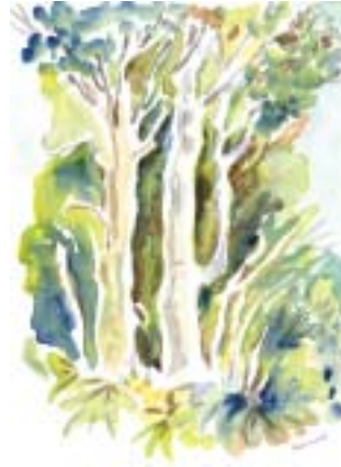
Fig No. 19