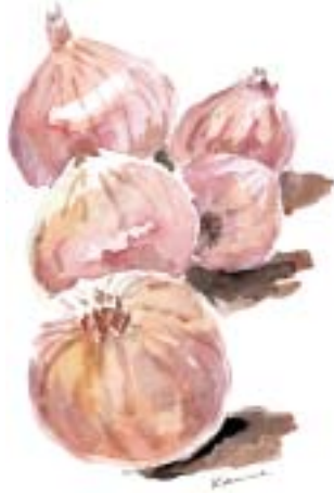
Fig. No. 11

Take a bunch of flowers. Make a study of these flowers with HB pencil. Draw the outline of the flower.