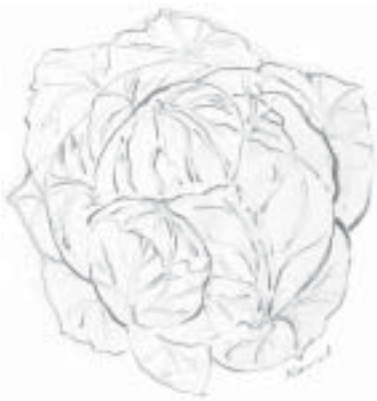
Fig. No. 3