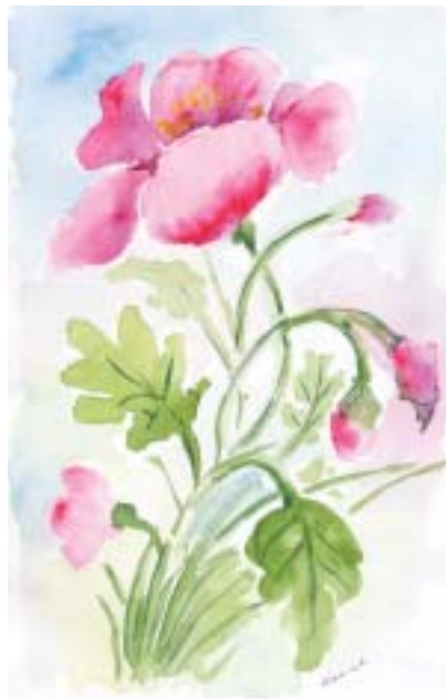
Fig No. 15