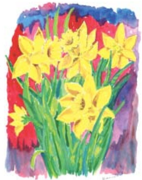
Fig No. 14