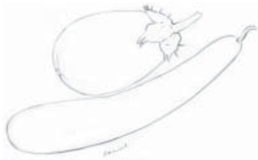
Fig. No. 4