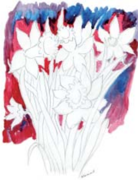
Fig No. 13

Now paint the flowers. Use chrome yellow, yellow ochre for the flowers. Dark green and light green (mixing white and lemon yellow) for the stems.