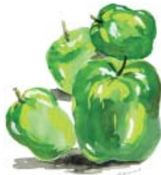
Fig. No. 7