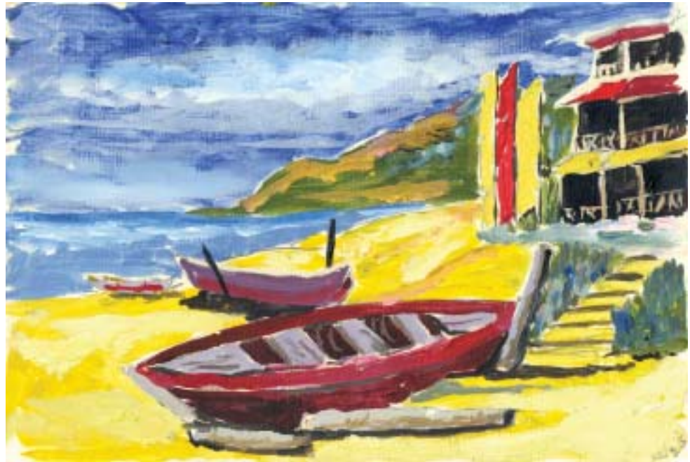
Fig No. 25