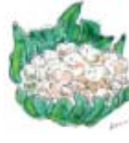
Fig No. 10