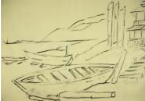
Fig No. 22

Draw only the outlines of your sketch on oil paper or canvas