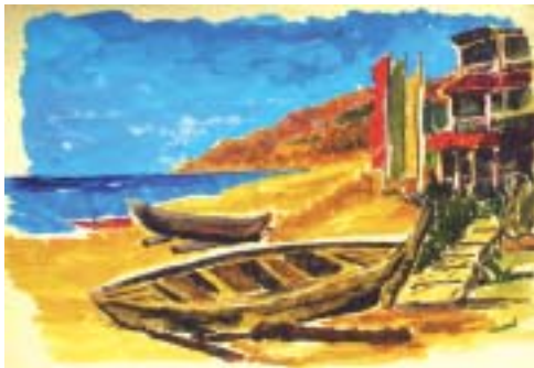
Fig No. 24