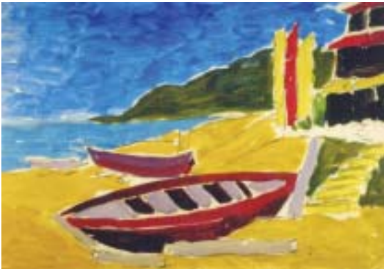
Fig No. 23

Fill the drawn areas with dark colours. The oil colours are different from water colour. Begin with dark colours in shadowed areas then move to lighter tones.