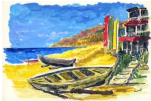
Fig No. 21