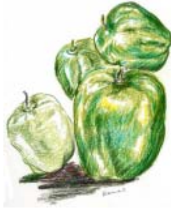
Fig. No. 6