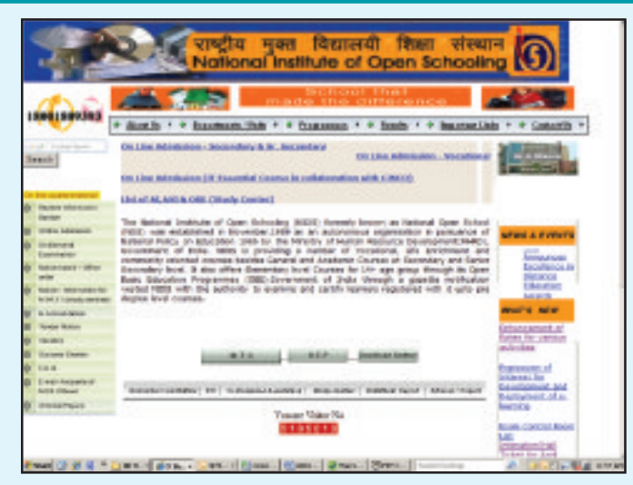
A new look for the NIOS website

In a drive to make its website more user friendly in terms of Accessibility and usability, the NIOS has redesigned its Home page by adding search facility as well as News and Events Section. Moreover different information has been categorized under related links such as 'About Us' consisting of the Profile, Mission and Vision and Objectives of NIOS. Apart from this, there is information about the different committees of NIOS, NIOS Publications and information about COMOSA. Information about the different Departments and Units and its activities have been included under the 'Department' Section. A complete list of NIOS Officials along with their designations and contact numbers has also been