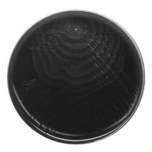
Fig. 25. 1: Swarming of Proteus

In liquid medium (peptone water, nutrient broth), Proteus produces uniform turbidity with a slight powdery deposit and an ammonical odour.