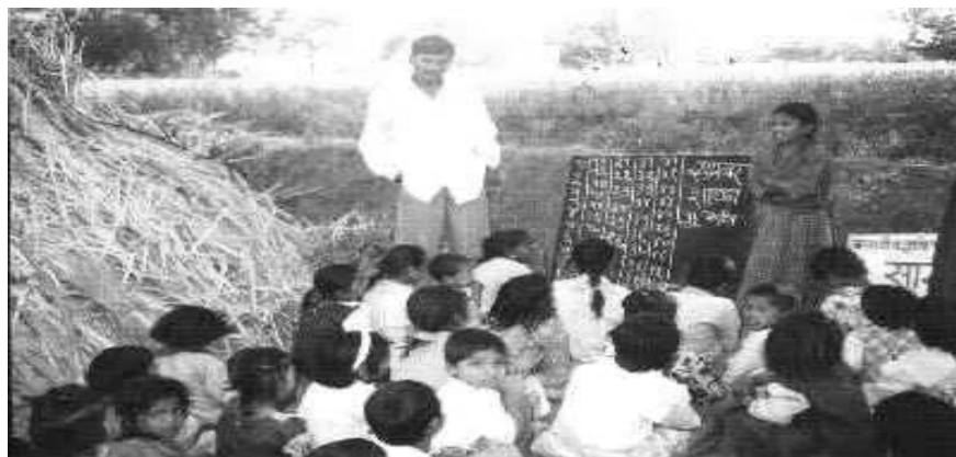
Sakhar Shala in Sugarcane farms

To solve such problems, in Maharashtra, state government introduced Sakhar Shalas in the year 2001 as a strategy to provide continuation of schooling in this case of physical displacement. Sakhar Shalas do not function round the year. They function only during the second part of the educational year. Usually schools commence in the month of June after the summer vacation. The children of sugar cane cutters migrate during the crushing season, which is in between October and November. During migration children do not attend schools for several months and when these families return to their villages in March/April the following year, children are unable to start their education from where they left off and thus are forced to drop-out. In Sakhar Shalas the classes are held between the migration periods (around six months) near sugar factories at times suitable to the students, Hence they are also called, 'Second semester school'.