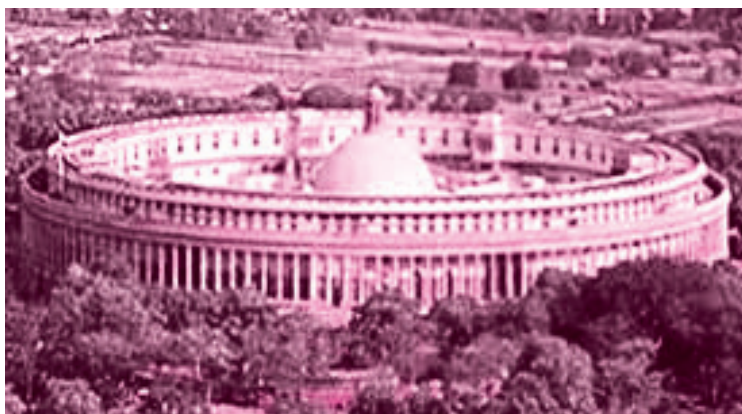
Figure 22.1: Parliament of India

The Indian Parliament consists of the President of India and two Houses namely the Lok Sabha (House of the People) and the Rajya Sabha (Council of States). Lok Sabha is directly elected by the people and Rajya Sabha is indirectly elected.