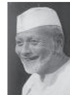
Ustad Bismillah Khan