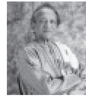
Pandit Ravi Shankar