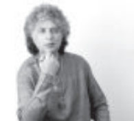
Shiv Kumar Sharma