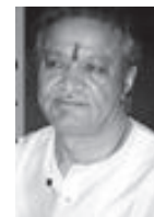
Hari Prasad Chaurasia