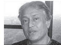
Amjad Ali Khan