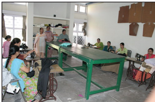
Students of NIOS in a Vocational (Cutting & Tailoring) class.