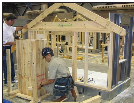
NIOS students in one of a Vocational (Carpentry) Training Programme.

NIOS offers some subjects as Life Enrichment Courses viz., Paripurna Mahila (Women Empowerment), Yog, and Hindustani Music etc. These courses are meant for self development and enrichment of knowledge. No examination is conducted for these courses. Some of these courses are also available as Certificate Courses in which the examination is conducted.