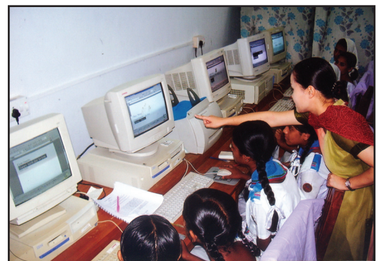
A training programme in progress

This course is equivalent to 10 th standard of the formal schooling system. One can join this course irrespective of any formal pre-qualification. Successful completion of minimum of five subjects is necessary for obtaining a certificate. Wide range of subjects are available to choose from. The course may be completed in minimum period of one year to a maximum of 5 years.