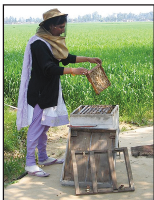
Vocational Certificate Course in NIOS in Bee Keeping.

NIOS also offers vocational education courses at school level keeping in view the