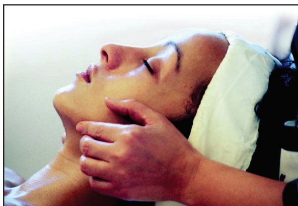
Students of NIOS in a Vocational (Beautician) class.