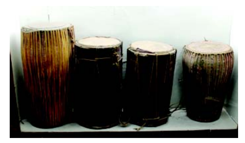
Fig. 9.1 Dhol (Drum)

pumpkin, seeds are used to make different instruments. Some of popular ones are drum, dhol, tuntuna, charchari, timki, sarangi, khartal, jaltarang etc. in Madhya Pradesh at harvest time, a buffalo-horn trumpet, the hakum is used in celebration. Other types of drums are mandri, kotoloka and kundir.