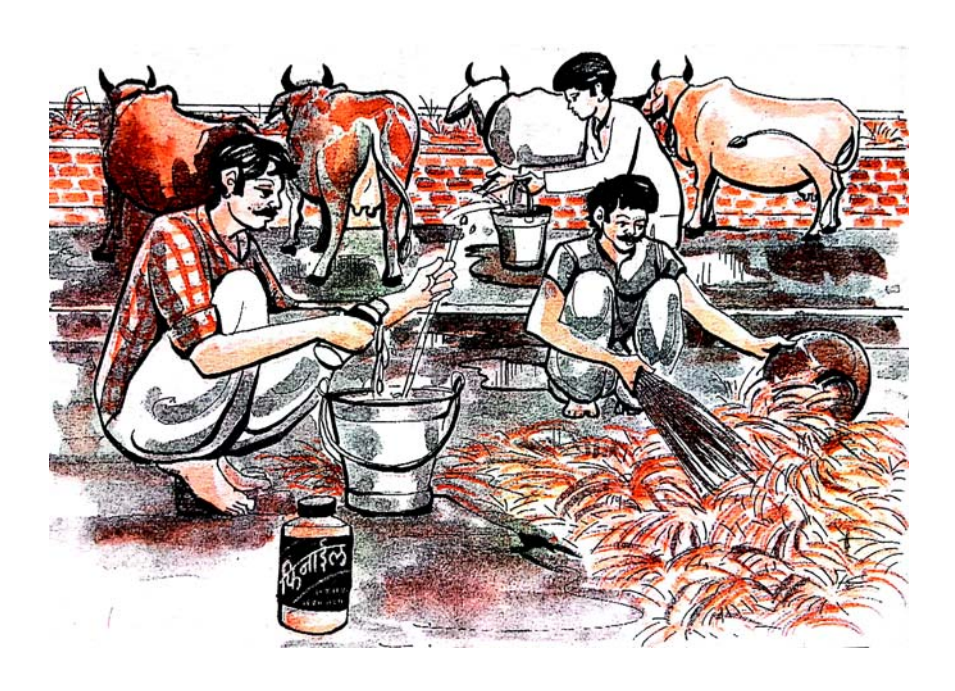
Fig. 4.4 Cleaning Goshala

There should be adequate flow of air and light in the goshla. It helps to keep it dry even in rainy seasons.