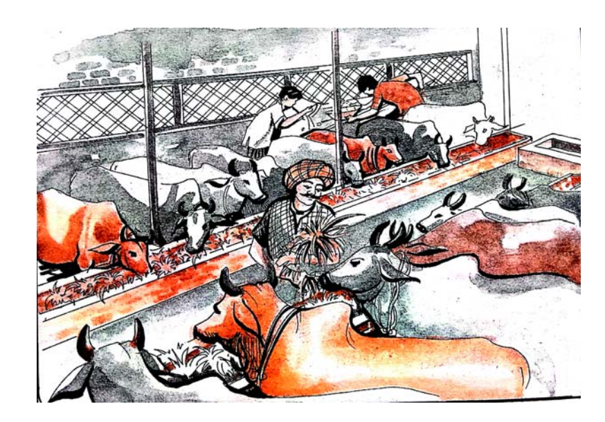
Fig. 4.2 Sufficent space in Goshala

Any type of products i.e. Stone Pillars, Brick Pillars, Wood Pillars, Unbaked brick walls, Baked brick walls or concrete walls may be used for wall making.