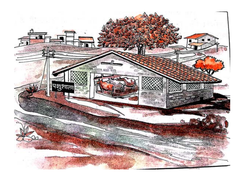
Fig. 4.1 Goshala

It is said that cowdung has the ability to disinfect the space of its