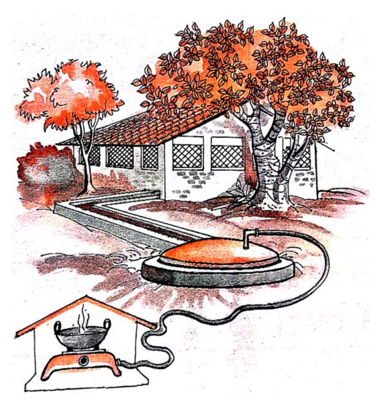
Fig. 4.5 Biogas