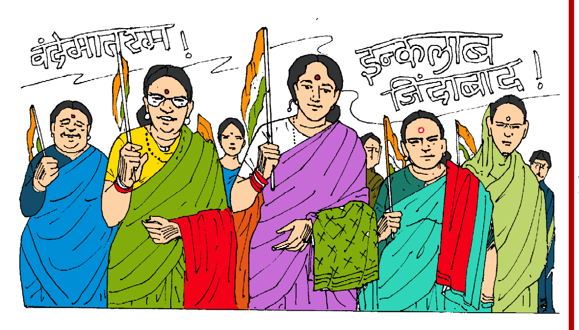
Fig 4.1 Women in the Freedom Struggle

The industrial revolution and the advancement of science and technology encouraged the British to introduce reforms to modernise India on the Western model. New ideas like humanism and rationalism replaced faith and superstition.