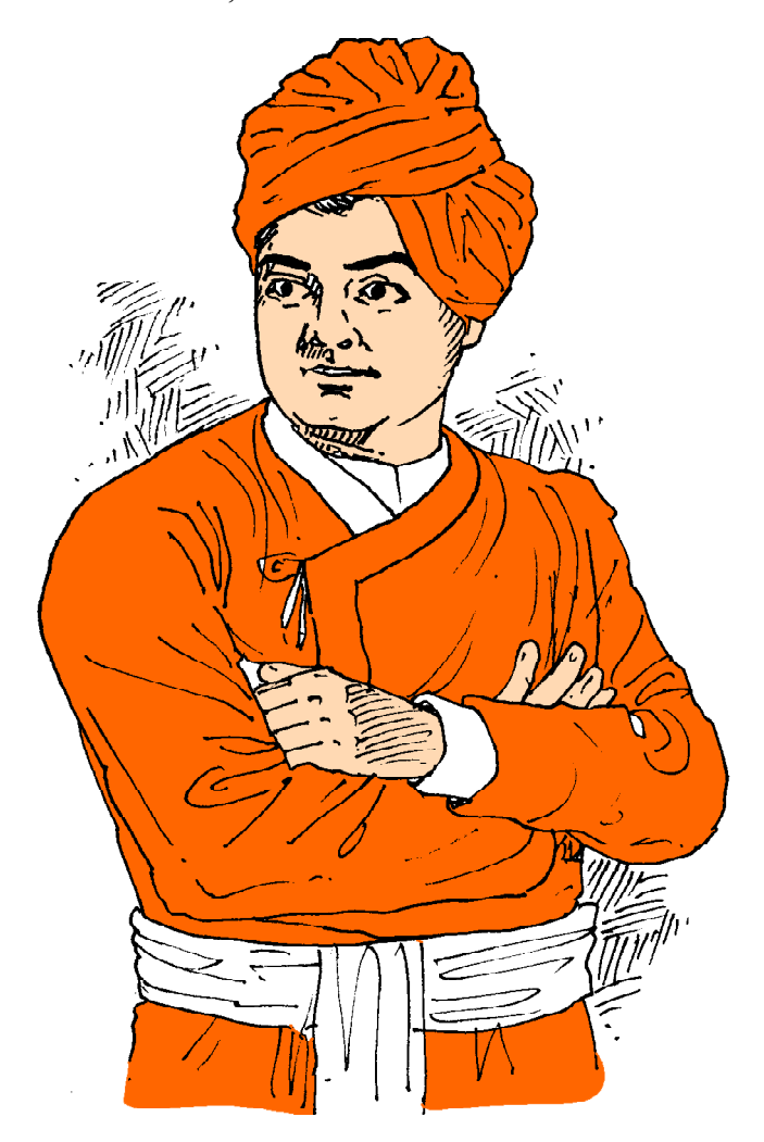
Fig 4.3: Swami Vivekananda

Swami Vivekananda vigorously advocated for the upliftment of the masses, particularly women. They recommended that daughters should be brought up and educated just like sons. According to him, any sound national education scheme for India could ill-afford to ignore the masses and women of India. He remarked: "Ignorance is the mother of all the evils and all the misery we see. Let men and women be educated, pure and spiritually strong and educated, then alone will misery cease in the world, not before".