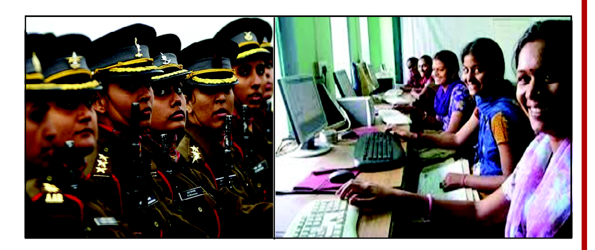
Fig 4.5: Women at modern occupation

As a result, there is an increase in the enrolment ratio of women in school and higher education levels, facilitating a surge of women's workforce in different walks of life. They are excelling in every newfound opportunity which comes their way. Women have achieved name and fame in science and technology, defence, sports, literature, music, dance and many more. They now perform the traditional roles of a daughter, wife or mother and effectively assume different occupational roles. However, despite tremendous achievements, women still face challenges on personal and professional fronts. Examples of such epidemic challenges include the gender pay gap, female infanticide, and the ongoing social evil of eve-teasing.