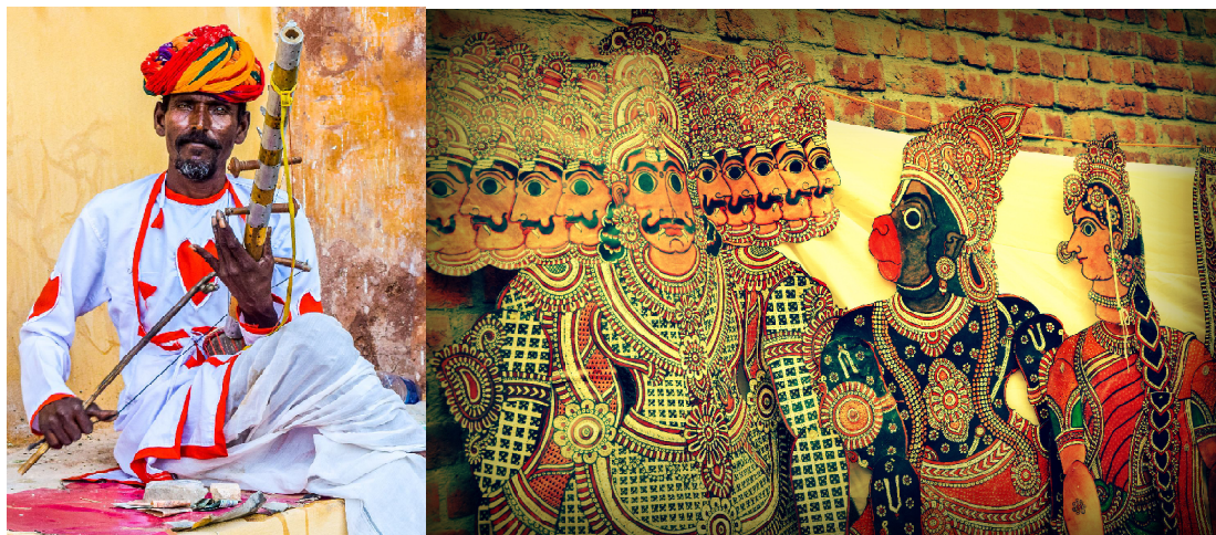
Figure 19.1 Folk Media

In earlier times, folk media were patriarchal primarily in their structure and presentation. Women had to forgo certain privileges and rights regarded as exclusive to men. They were constantly exhibited as inferior to their male counterparts, presented only in the roles of mothers, sisters, wives, and daughters, being confined to the four walls of their homes. They were shown proud women who would forgo their lives to care for their family members. While women were shown as dedicated nurturers and physically attractive, men were shown as breadwinners, protectors of women, and the head of families.