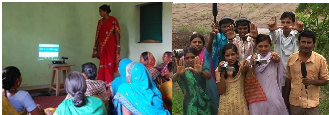
Fig 19.4. Images of Participatory Video