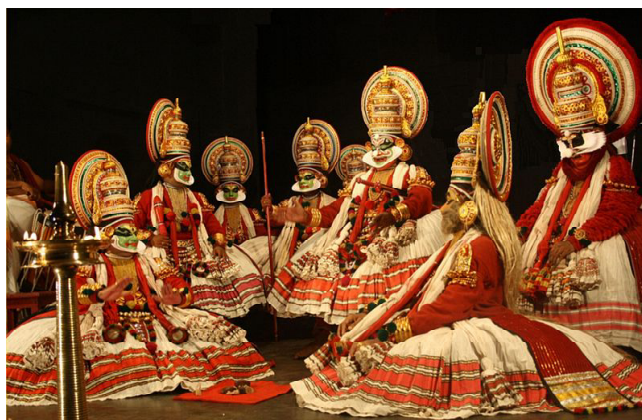
Figure 19.2 Folk Media: A Kathakali Performance