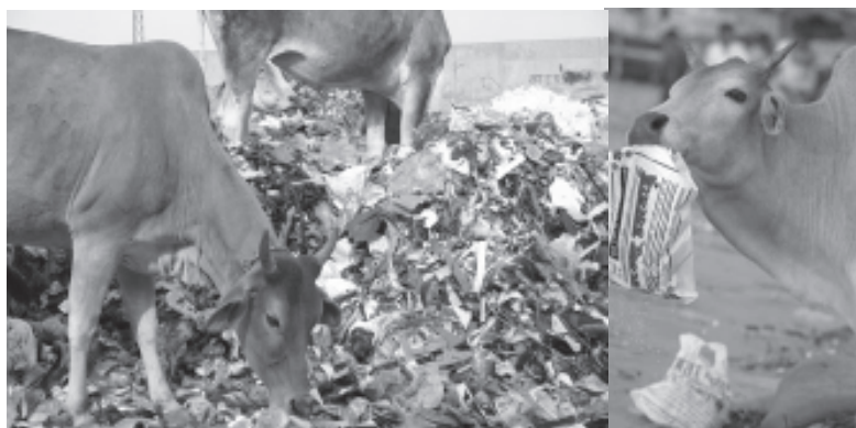
Fig. 10.3: A pile of plastic bags along with leftovers- a cow eating them