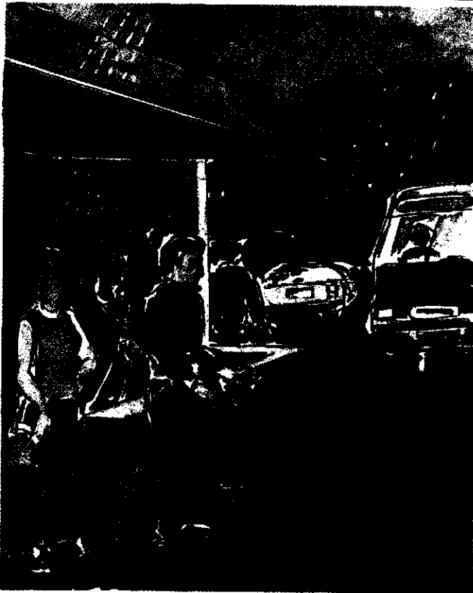
Rain in secondary and tertiary colours