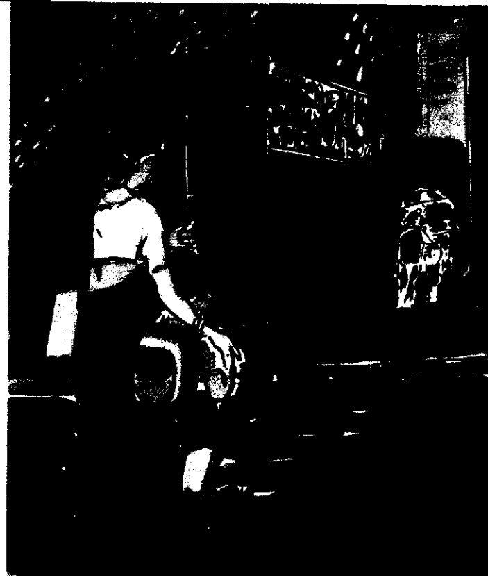
Rain in primary and secondary colours