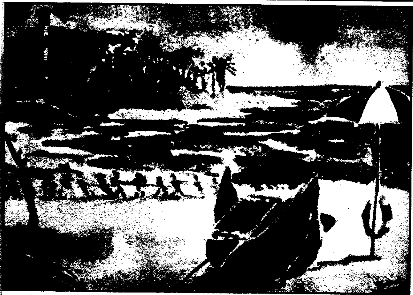
Composition with warm and cool colours