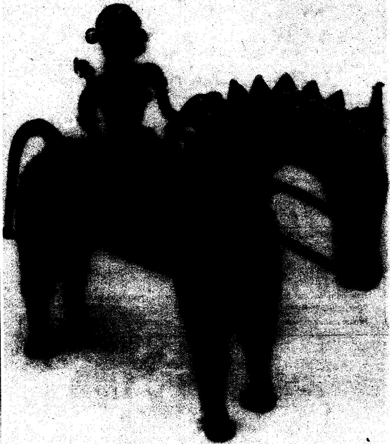
Dokra casting (Tribal Bronze casting)