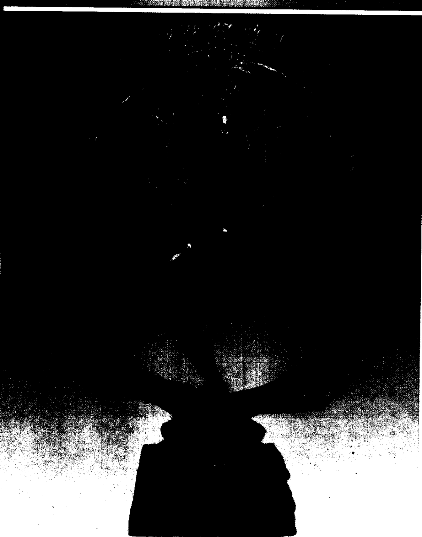
Cosmic Dance of Lord Shiva