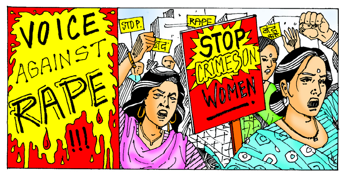
Fig 20.2. Support for Women's cause in internet

In the traditional media, the basics and issues of women's empowerment has not given much attention as it is supposed to be. The issues of equality, justice, respect and dignity of women have not been given due importance. Instead, it has thrived on saleability. Media had been showing the News of rape or violence against women not as a cause but to raise the level of viewership. New media has entered this area as a reliable tool to influence people. The new media had mobilised the people on the incidence of the Nirbhaya Rape case and other similar issues of social concern