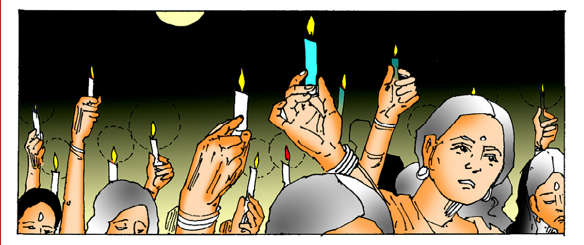
Fig 20.3. Support for social cause

During the Nirbhaya case (Rape and murder of a young girl), new media played a significant role. Thousands of people were mobilised at India Gate to protest against the heinous crime. The new media built an atmosphere of concern against such crimes. As a result, a change in society was visible.